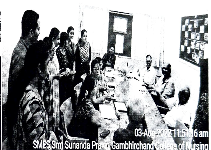
SMES Smt. Sunanda Pravin Gambhirchand College of Nursing