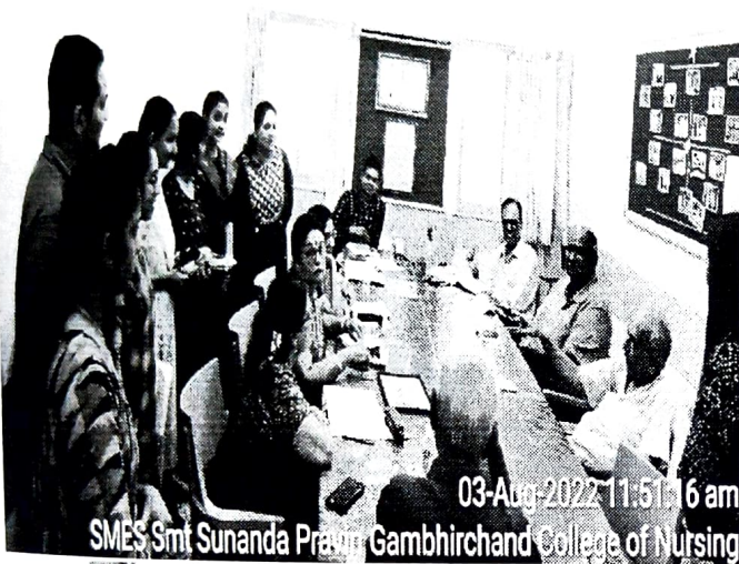
SMES Smt. Sunanda Pravin Gambhirchand College of Nursing

SMT. SUNANDA PRAVIN GAMBHIRCHAND COLLEGE OF NURSING, GNM SCHOOL OF NURSING (Proposed) & ANM SCHOOL OF NURSING Affiliated to: Maharashtra University of Health Sciences, Nashik. Maharashtra State Board of Nursing and Paramedical Education Recognised by: Indian Nursing Council, Maharashtra Nursing Council MUHS IMPACT ASSESSMENT A+ GRADE (2018-2019)